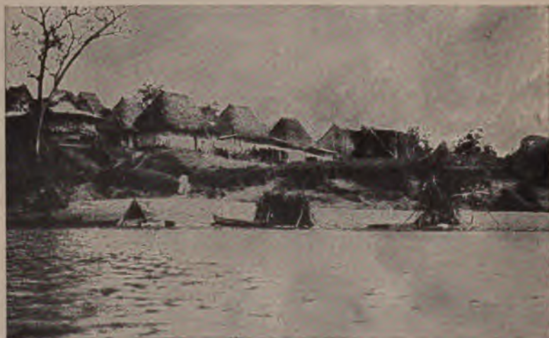
Cruces on the Chagres